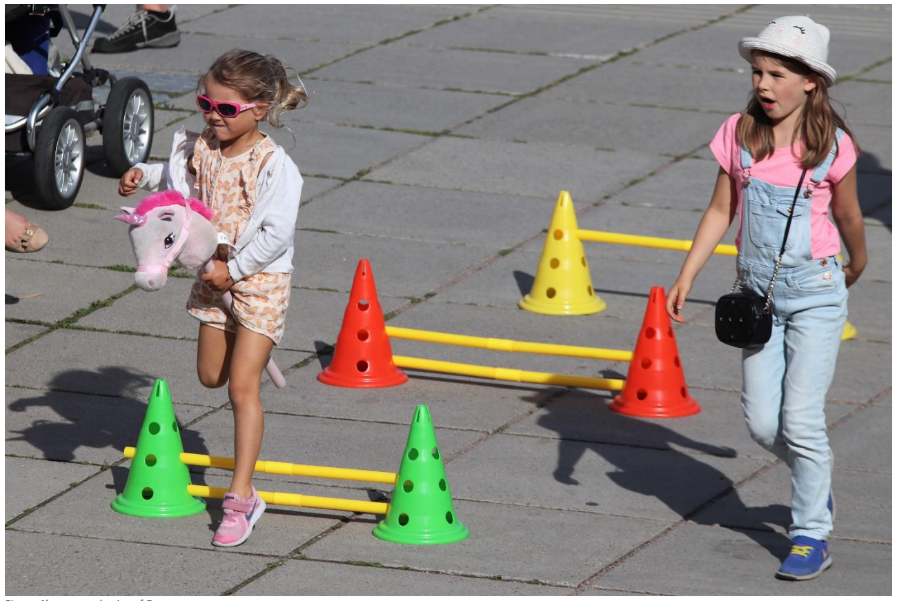
Figure Shutterstock, city of Espoo

This event emerges the EU Commission Mission Board for climate-neutral and smart cities in Horizon Europe and Horizon 2020 Smart City Lighthouse projects citizen engagement experiences and lessons learned.